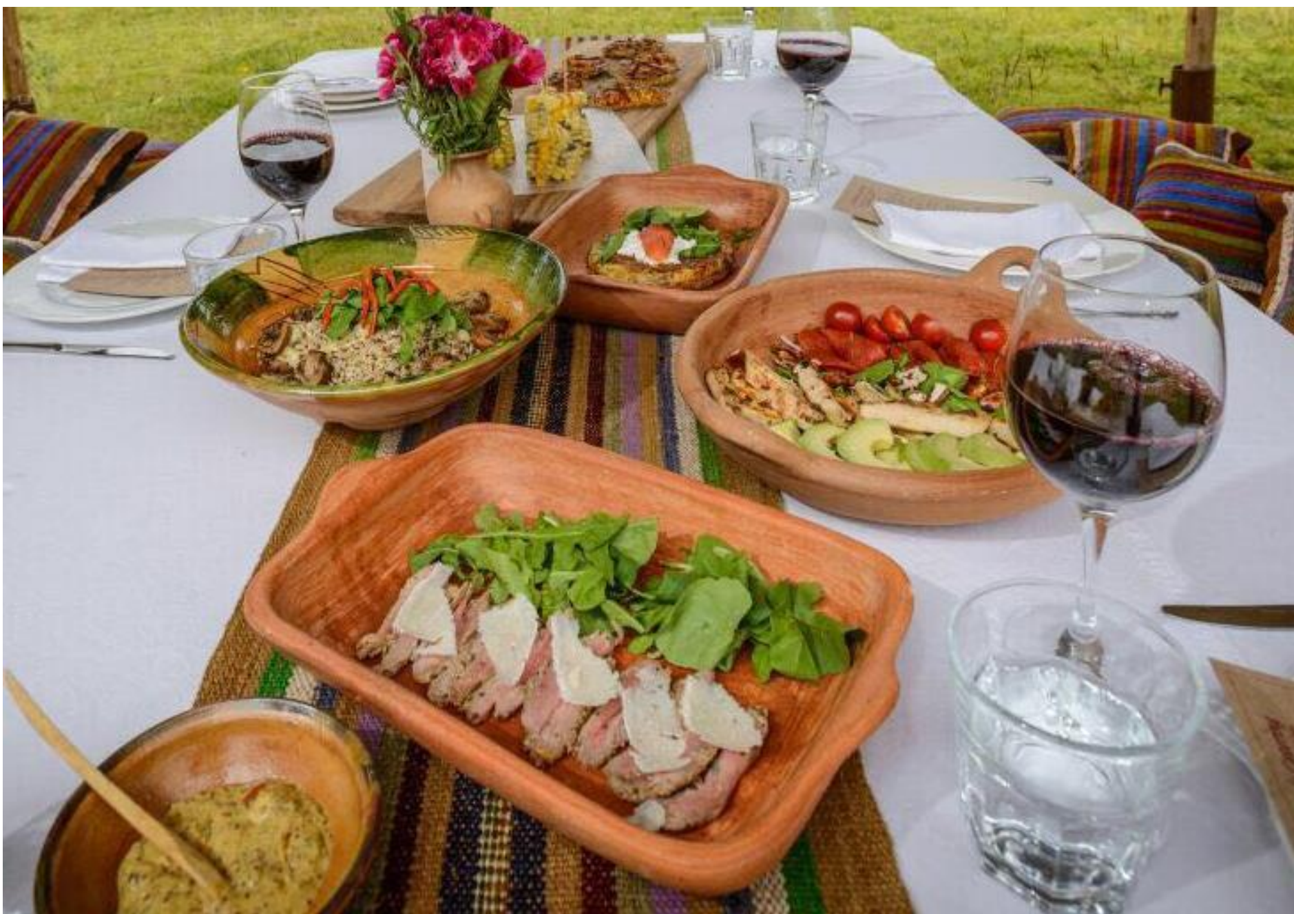
Picnic at Tinajani Canyon